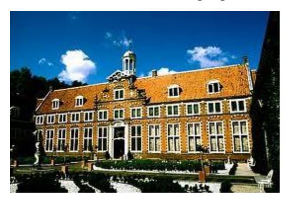
Fig. 2 Franz Hals museum, initially a nursing home

Since ancient times the society felt the need to protect their seniors citizens, after the society had a form of organisation, but the first tangible evidence in this regard is from the Middle Ages. At first, the primary form of isolation was made from sanitary reasons, only sick people or those who where affected by epidemic. The most notoriously epidemic, bubonic plague, took place between 541-542 in Constantinopole. In the years 541 and 542, bubonic plague struck Constantinople, and over 40% of the population in city was killed (about 10 thousand people a day). Spreading throughout the Mediterranean, balance estimated death toll was about 25 million. In the next 800 years nothing awful happend, until the middle of XIV centrury, when bubonic plague of Justinian returned, killing a quarter of Europe population and around 137 million people worldwide.