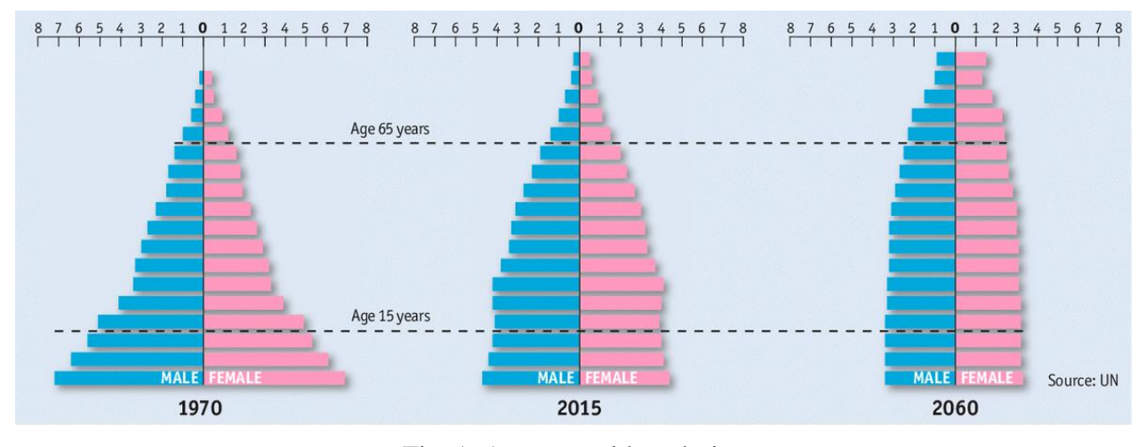
Fig. 1. Age pyramid evolution

Global ageing phenomenon has consequences in all areas: economy, social activities, architecture, politicy. Ageing population also requiers other working conditions, other schedule other functions in order to provide them comfortable living.